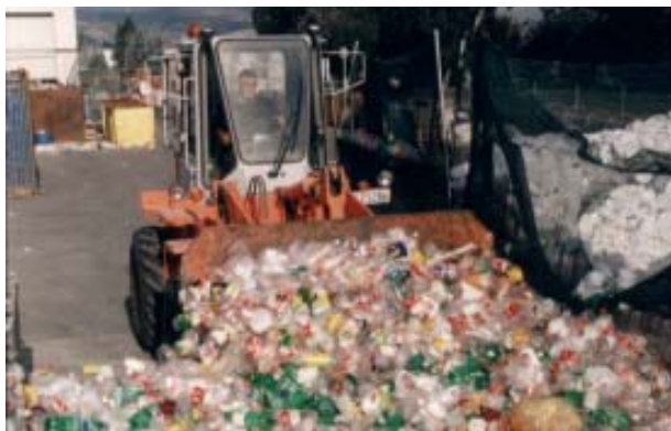
Plastic PET bottles collected at the kerbside ready for processing at the Recovered Materials Foundation's Parkhouse Road site.

The RMF recognises that to be fully effective, it must work at every level of recycling development. It provides services and expertise in business development, marketing, advocacy, information and research, and recovery methods. Critical to the RMF's success is the CCC's long-term investment in recycling and its control and ownership of both recovered materials and the city's waste stream.