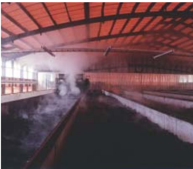
This composting plant, owned by Wellington City Council and operated by Living Earth Ltd, converts garden waste and biosolids from the city's waste water treatment plant, into high quality compost.

The Living Earth Company is also addressing Maori concerns about using human wastes on land used for growing food. The debate goes on, and illustrates the complex issues that will arise as we separate our waste streams.